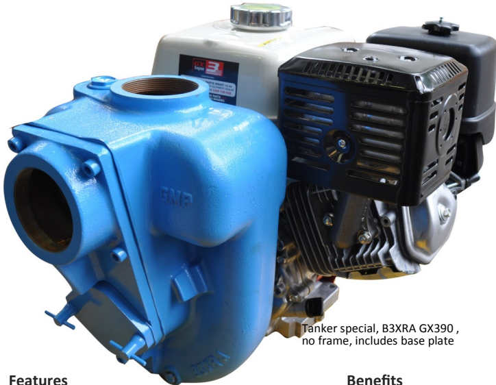
Tanker special, B3XRA GX390, no frame, includes base plate

Aussie GMP 2", 3" and 4" self priming centrifugal engine drive pumps designed for high and low pressure operations.