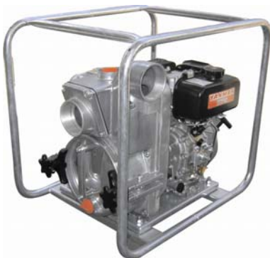
QP203T L48 (shown without 2" reducing nipple)