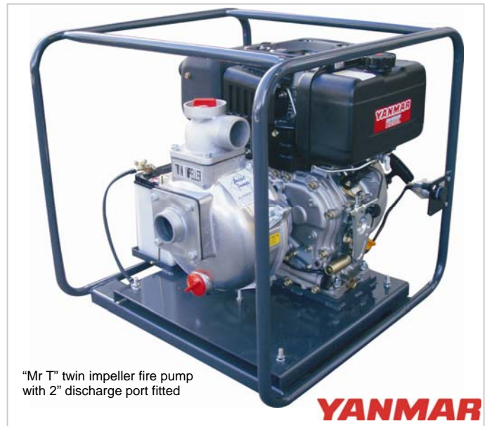
"Mr T" twin impeller fire pump with 2" discharge port fitted

Engine options include 7HP (recoil & electric start options) or 10HP electric start Yanmar diesel engines.