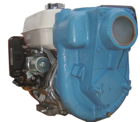
Honda version ... tanker special (on frame)

These heavy duty pumps are suitable for a wide range of industrial and agricultural applications.