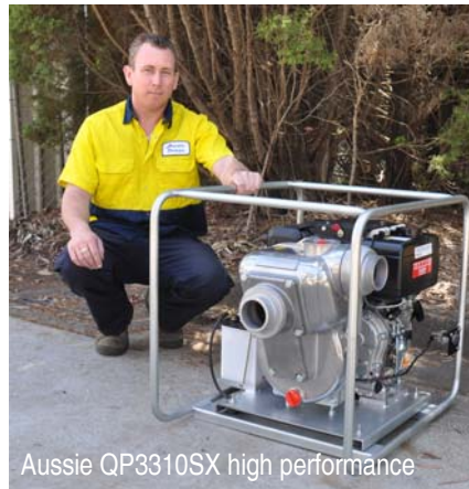
Aussie QP3310SX high performance