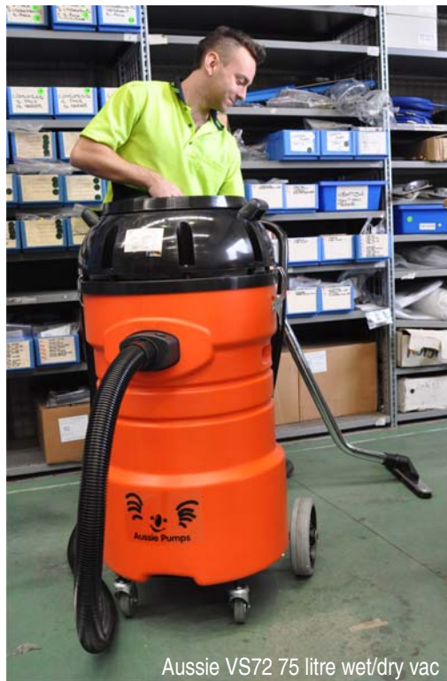
Aussie VS72 75 litre wet/dry vac

Called the Clean Air VS72, the big 75 litre wet/dry vac comes with an impact resistant, heavy duty poly propylene barrel. Two big 1200 watt, 240 volt by-pass motors provide loads of suction power making it suitable for clean up in industrial & processing workshops.