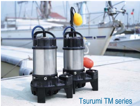
Tsurumi TM series

A new corrosion resistant pump has been released by Aussie Pumps designed specifically for marine applications. Manufactured by Tsurumi Pump, the TM series is perfectly suited for salt water pumping including circulating seawater in live fish holding tanks, waste water transfer and even deck wash-down.