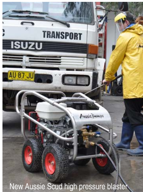
New Aussie Scud high pressure blaster

Aussie Pumps has launched a new series of machines and accessories aimed at the world market. Called the "Aussie Scud" series, the new system is based on a new range of pressure cleaners and accessories designed to provide more cost effective cleaning solutions, with minimal environmental impact.