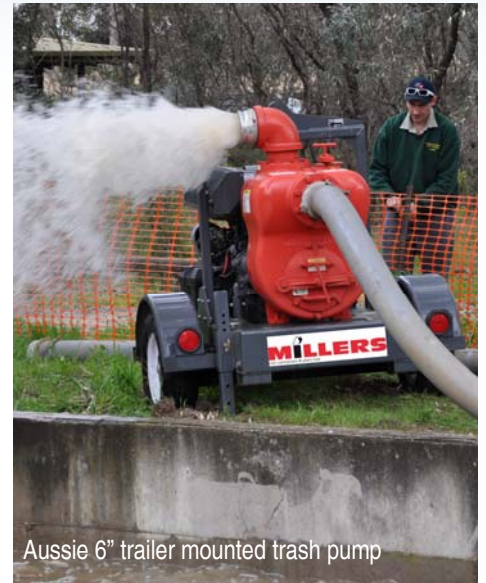
Aussie 6" trailer mounted trash pump

When the Council called on Miller Contractors, they were able to get the pump to the stormwater basin in record time, playing a vital part in saving the CBD from rising flood waters.