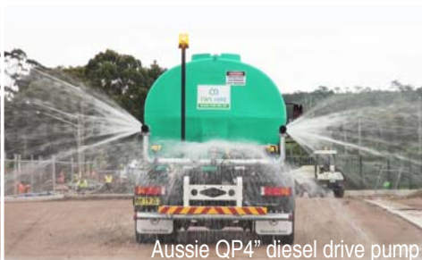
Aussie QP4" diesel drive pump

Gary Bastian of The Watercart Specialists (TWS) needed to slash tanker operating costs. He designed his new water carts to drench a track up to 50 metres wide, significantly reducing the time taken to wet down large areas.