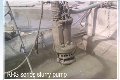
KRS series slurry pump

The pumps are designed to agitate and mix concrete and also aid in the reclamation of materials from unused concrete at batch plants. The KRS slurry pump series offer capacities of up to 3,250 lpm flow, heads as high as 22 metres and discharge bores from 80mm (3") through to 150mm (6").