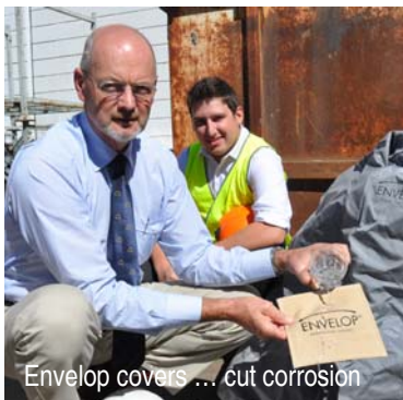
Envelop covers ... cut corrosion

Aussie Pumps originally introduced Envelop covers for Navy applications. The covers are now standard on most RAN vessels including all ANZAC and FFG Class frigates. Envelop covers are a unique, patented design. Contact Aussie for a free DVD.