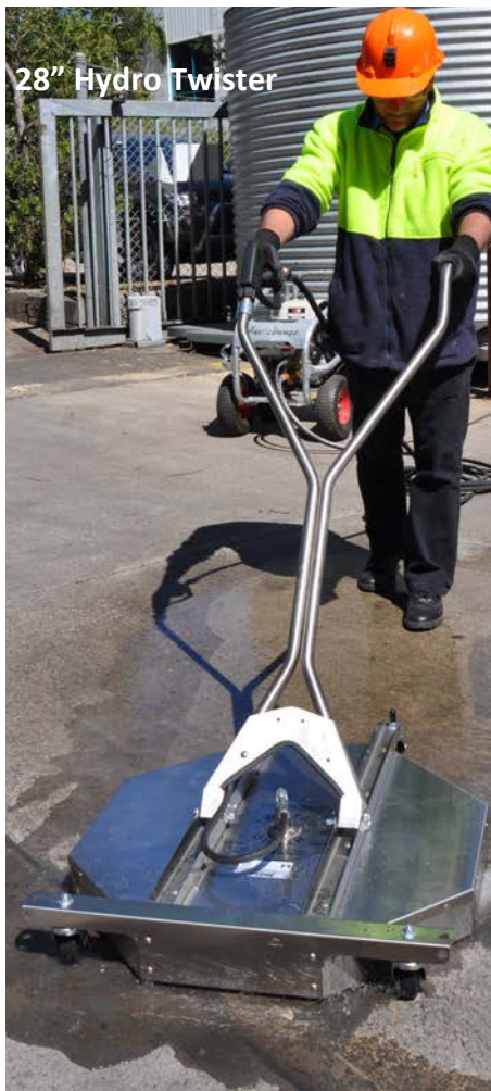
28" Hydro Twister