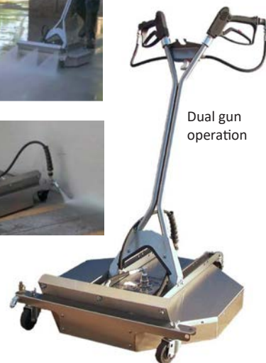
Dual gun operation