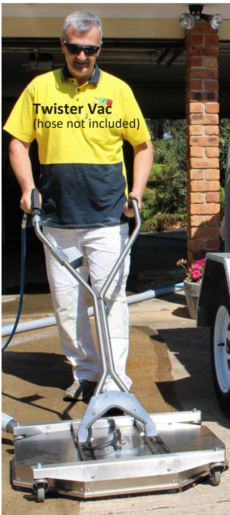
Twister Vac (hose not included)