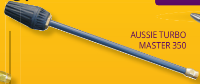
AUSSIE TURBO MASTER 350