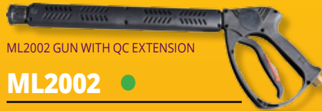
ML2002 GUN WITH QC EXTENSION