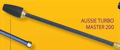
AUSSIE TURBO MASTER 200