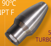
500 BAR TURBO HEAD

CTN500-020 - Suits: Raptor 12 $1,350 +GST CTN500-025 - Suits: Raptor 16 $1,350 +GST