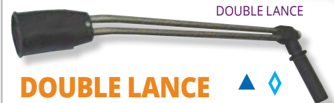
DOUBLE LANCE ▲ ◆