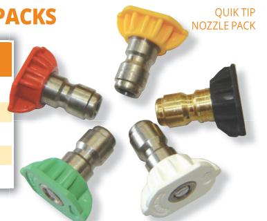
QUIK TIP NOZZLE PACK