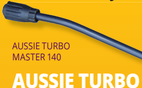
AUSSIE TURBO MASTER 140