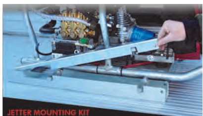
JETTER MOUNTING KIT