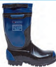
Aussie Jet Stop boots