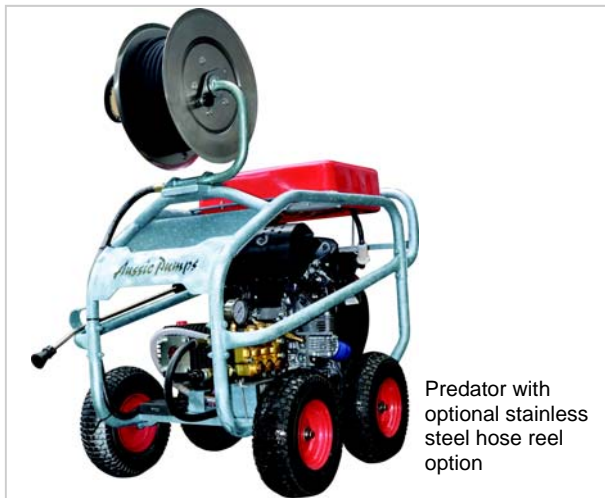
Predator with optional stainless steel hose reel option

Industrial petrol and diesel powered hydro-blasters made for the toughest cleaning applications including paint stripping, rust removal and hydro demolition.