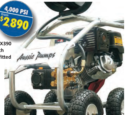
ABSC40/GX390 Shown with hose reel fitted